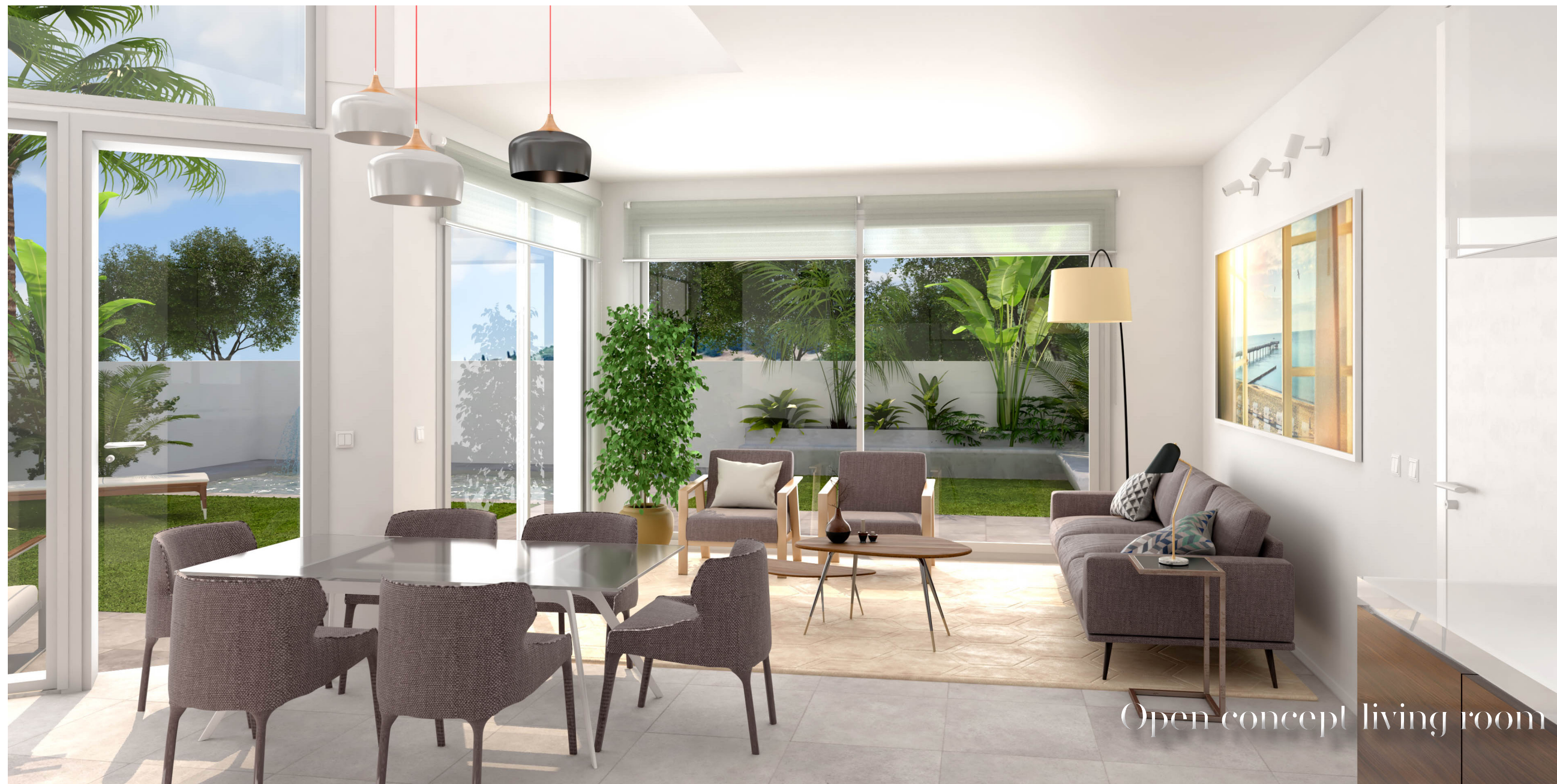
Open concept living room